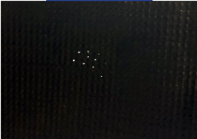
Fabric Pin Hole Damage