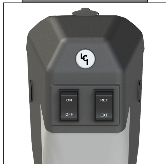
Fig. 2 - LCI Jack with Sticker