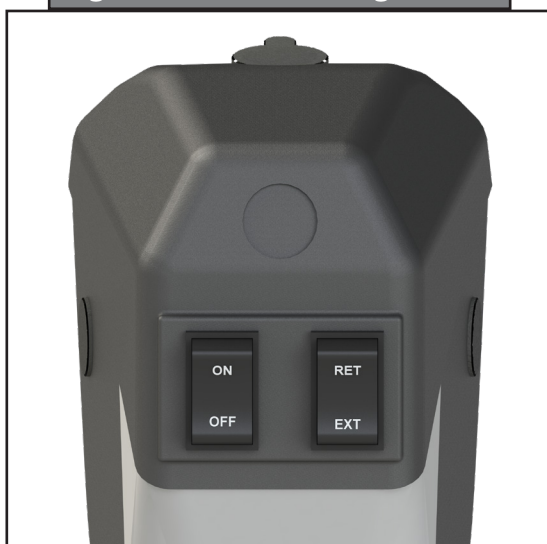
Fig. 3 - LCI Jack Missing Sticker