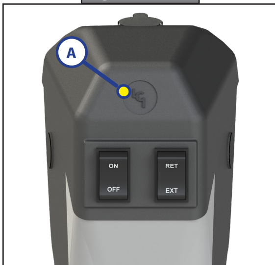
Fig. 1 - LCI Jack