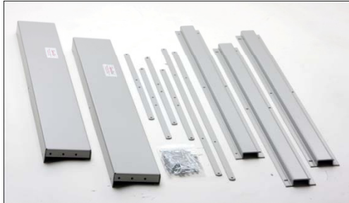
Trim Kit includes: (2) End Pieces, Jig Kit, and (3) Mid-rails. No flooring materials are included in the kit.

Width determined by selecting Trim Kit width to fit compartment width less 4" (see guide to the side)