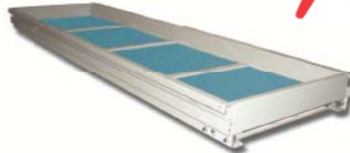
Shown as installed. Slide assemblies ship with side slide assemblies and require trim kit—you create slide floor from plywood and covering (not included.)